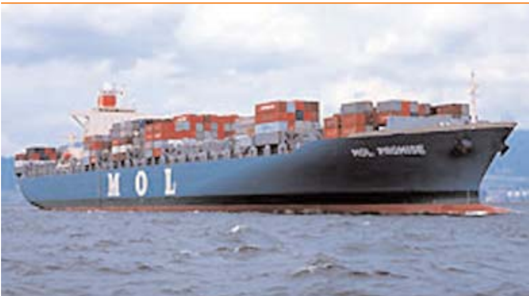
Container ship MOL

Project: Upgrade of Oracle FORMS 6i cs to 10g with PITSS.CON